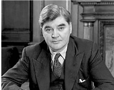
Aneurin 'Nye' Bevan 1897-1960