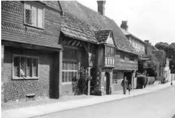
Anne of Cleves House