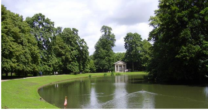
The lake at Althorp with the Princess Diana Memorial beyond