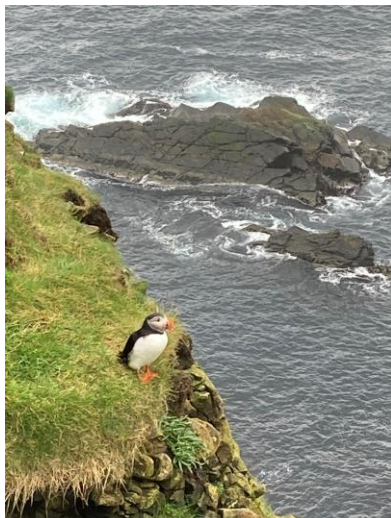
Sumburgh Head Bird Cliffs, Shetland's most southerly point

07956 819008 02085901827 eileen_brooks@yahoo.co.uk