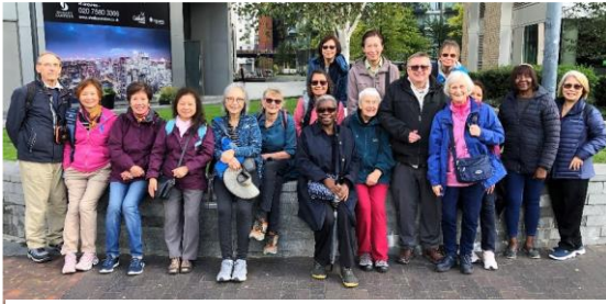
Walkers on the Sept. 2022 Cutty Sark walk