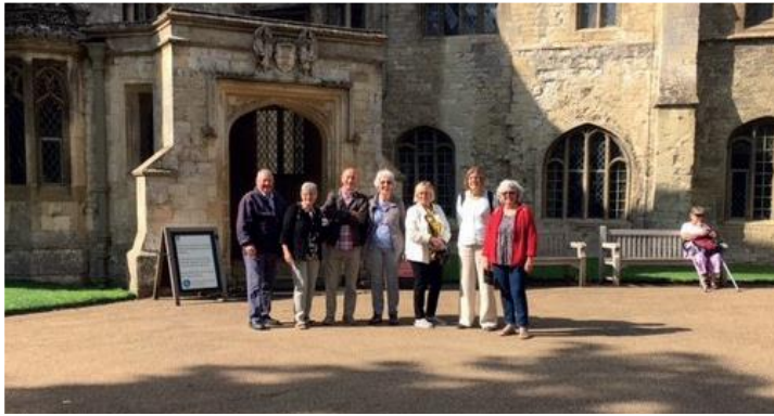
Anglesey Abbey on our shared trip with Northampton Branch