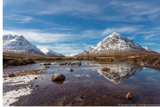
The beauty of Glencoe