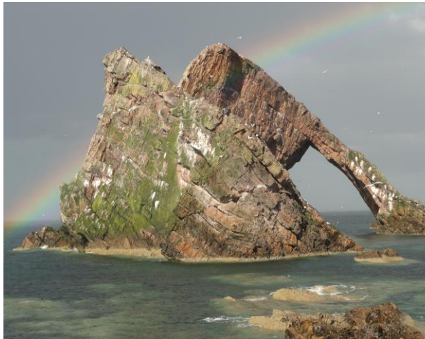
Bow Fiddle Rock, Portknockie, Moray, North Scotland, with the hint of a rainbow.