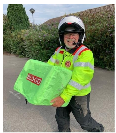
Another blood delivery begins its journey.

SERV receives no money from the Government, NHS or regulatory body and relies on donations from members of the public, corporate sponsorship and charitable organisations plus their own fund-raising activities to raise money to keep the service running.