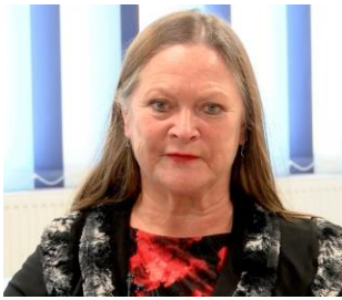
Suzy Brain England OBE