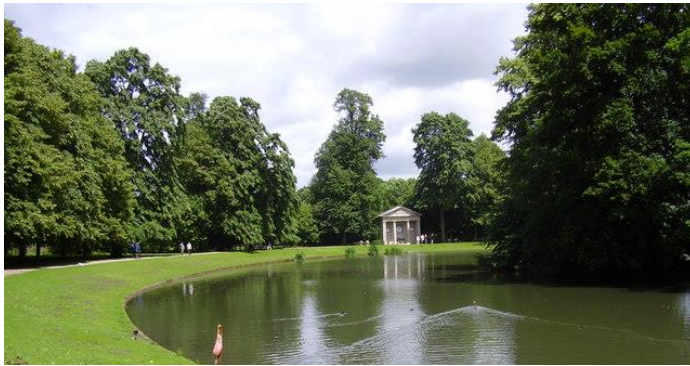
The lake at Althorp with the Princess Diana Memorial beyond