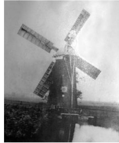
The mill as it stood in 1930

One hundred years ago windmills working alongside our rivers to drain the adjoining marshes were a common sight. Hardley Windmill was one such drainage pump operating beside the River Yare in Norfolk. The windmill powered an Appold turbine (similar to the impeller on your central heating) capable of raising twelve tons of water per minute via a twelve-foot-high vertical shaft, five feet in diameter. One revolution of the sails, with the gearing, gives an increase of 10.7 on the turbine.