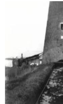
The second tractor through the back w

However, during the floods of 1953 Hardley Mill was used, powered by two tractors to help clear the flood water from the fields back to the river.