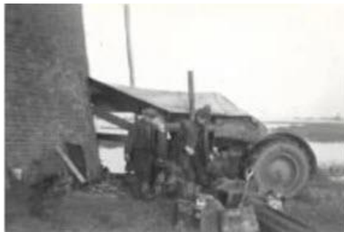
First tractor connected through the door