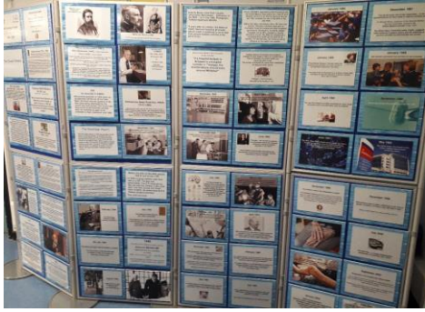
Bury St. Edmunds Event