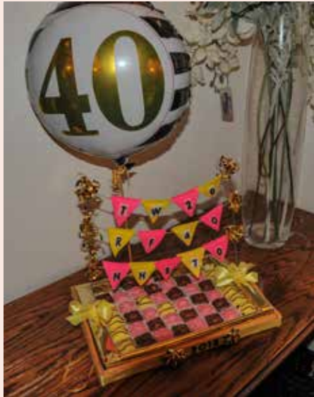
20 – 40 – 70: a year for celebration in Tunbridge Wells

Tunbridge Wells branch combined several celebrations in December and enjoyed a special meal at a pub in Pembury to mark the 70th Anniversary of the NHS, the 40th anniversary of the Fellowship and the 20th anniversary of the branch.