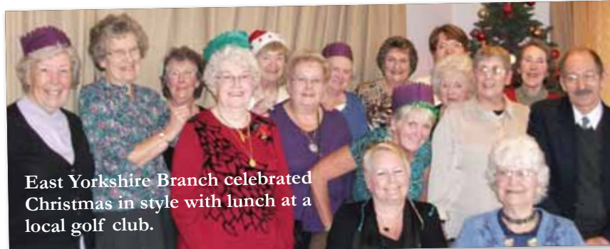
East Yorkshire Branch celebrated Christmas in style with lunch at a local golf club.

North West Surrey Branch had a really interesting day visiting the home of the Enigma codebreakers, Bletchley Park in Buckinghamshire. The day included a tour by a very informative guide around the pre-fabricated huts where 8,500 people worked during the second world war. There was also time to look around the many exhibitions and collections as well as the Post Office. As the Official Souvenir Guide explains “Thousands of people who worked at Station X (as Bletchley Park was known) did not win the war, but they certainly shortened it”