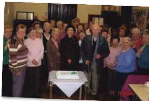
Celebrating the anniversary – members of Edinburgh and Lothians with their celebration cake.